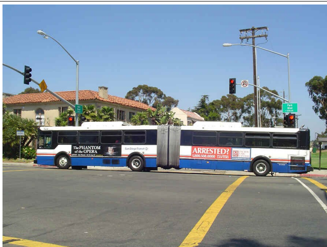
First assignment as a bus driver.

Obtained my CLASS 'B' Commercial License after a 6 week/ 6 days/week bus driving school with San Diego Transit. License includes Passenger Endorsement & Air Brakes.